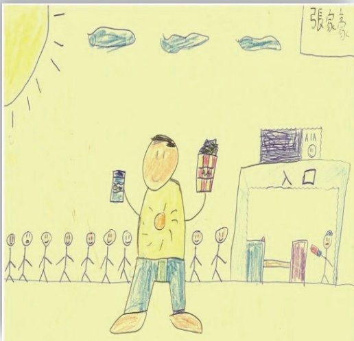
▲ A thank you card from Tsung Tsin Mission of Hong Kong Social Service. ▲ 深恩軒的感謝卡。

Stelux' charitable volunteer team participated in various activities with charities like Hong Fook Church Bradbury, The Tsung Tsin Mission of Hong Kong Social Service, Evangel Children's Home, Hong Chi Association, Food Angel and Orbis which target low-income families, orphans and children from broken families, those with intellectual special needs and sight saving respectively. Activities included hosting a group of young children to attend a leather craft workshop, hosting a group of young children to a day trip at the AIA Carnival 2017, special games booths and activities to celebrate the Christmas with children in need; sponsoring the "Hong Chi Climbathon, helping to raise donations for "ORBIS World Sight Day 2017". Other sponsorships included free tutorial classes for underprivileged students; gift packages of basic groceries, fresh fruits, vegetables to food banks for low-income families; the provision of eyeglasses and eye examinations for underprivileged children. Our volunteer team continues to grow in size and services with experienced volunteers and new volunteers joining in the activities.