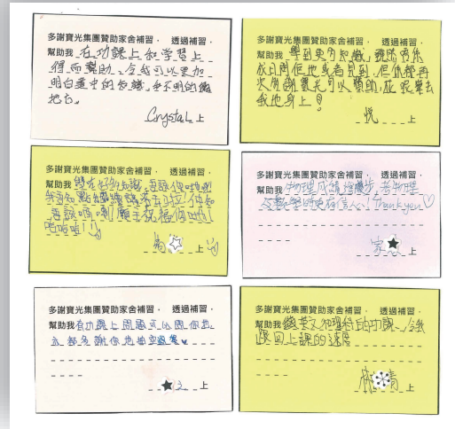
▲ A thank you letter from Evangel Children's Home tutoring class. ▲ 播道兒童之家功課輔導班的感謝信。

寶光慈善義工隊參與各式各樣的義工活動，與播道會康福堂、基督教香港崇真會社會服務部、播道兒童之家、匡智會、惜食堂及奧比斯等慈善團體合作。以上慈善團體致力協助低收入家庭、孤兒及破碎家庭的小朋友、智障人士及救盲。我們與以上慈善團體合作舉辦多項活動，包括攜帶小朋友參加皮革工藝工作坊；攜帶小朋友到AIA嘉年華2017一日遊；設立特別遊戲攤位、舉辦活動與有需要兒童一起慶祝聖誕節；贊助匡智會「慈善跑樓梯大賽2017」；及協助「奧比斯世界視覺日2017」的籌款工作。其他贊助項目包括為貧困學生提供免費功課輔導班；向食物銀行提供給予低收入家庭的基本雜貨、新鮮水果及蔬菜；向貧困兒童提供眼鏡及驗眼服務。我們的義工團隊規模及服務次數日漸增加，新加盟的義工聯同資深義工攜手參與活動。